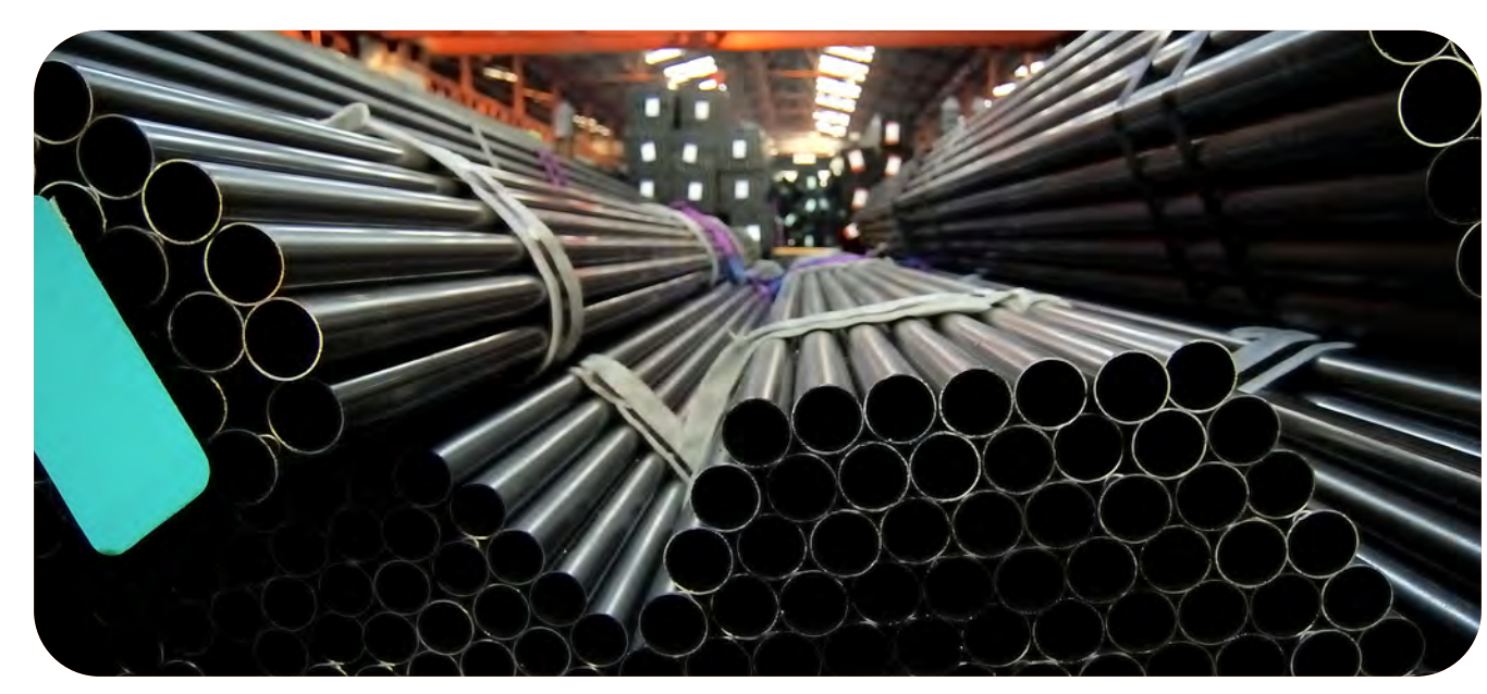
Differences versus Previous Versions

PERE = Use of renewable primary energy excluding renewable primary energy resources used as raw materials; PERM = Use of renewable primary energy resources used as raw materials; PERT = Total use of renewable primary energy resources; PENRE = Use of non-renewable primary energy excluding non-renewable primary energy resources used as raw materials; PENRM = Use of non-renewable primary energy resources used as raw materials; PENRT = Total use of non-renewable primary energy resources used as raw materials; PENRT = Total use of non-renewable primary energy resources; SM = Use of secondary material; RSF = Use of renewable secondary fuels; NRSF = Use of non-renewable secondary fuels; FW = Use of net fresh water